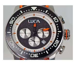
CH-1, Obs-Flame, Hybrid Black

Apparel selections and watch parings will be finalized on day of shoot. These are suggestions only. Outfits can be paired with more than one watch face and with or w/o jacket.