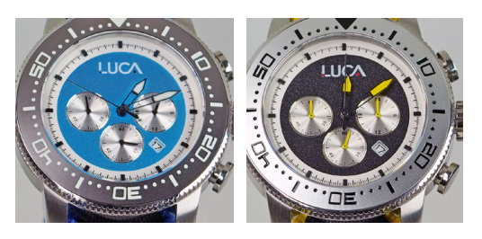
CH-1, Brandeis, Blk Hybrid or Obs-Firefly, NATO