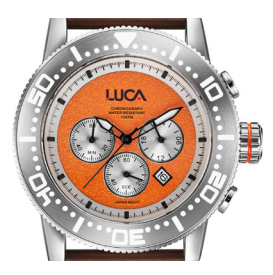
Flame (Orange) Weekend Business Casual Dress "Outdoor" Off Wrist