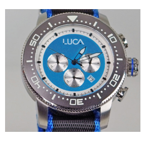
Brandeis (Blue) □ Weekend □ Business Casual □ Dress □ "Outdoor" □ Off Wrist