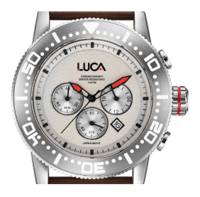
Pearl (White) Weekend Business Casual Dress "Outdoor" Off Wrist