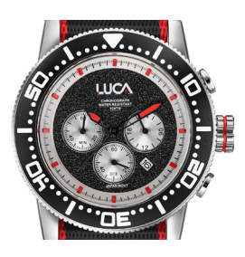
Obsidian Rosso (Black/Red) Ueekend Business Casual Dress 'Outdoor" Off Wrist