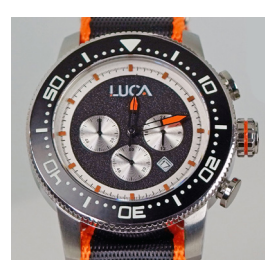
Obsidian Flame (Black/Orange) Ueekend Business Casual Dress 'Outdoor" Off Wrist