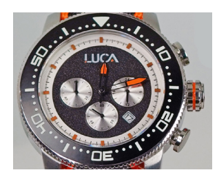
CH-1, Obs-Flame, Lt Leather