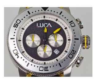
CH-1, Obs-Firefly, Hybrid Brown