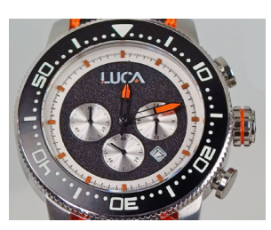
CH-1, Obs-Flame, Hybrid Brown