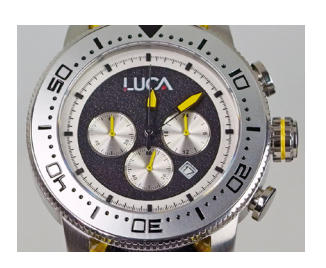
CH-1, Obs-Firefly, Hybrid Brown