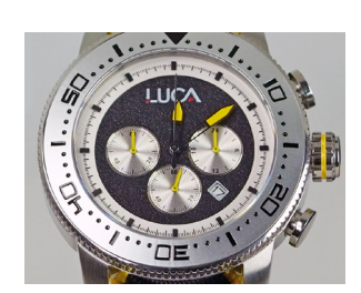
CH-1, Obs-Firefly, NATO