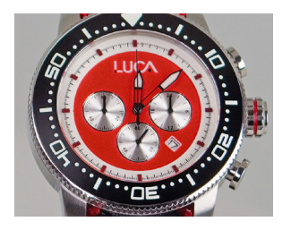
CH-1, Rosso, NATO