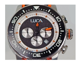
CH-1, Obs-Flame, Hybrid Brown