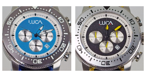
CH-1, Brandeis, Dk Leather or Obs-Firefly, Lt Leather