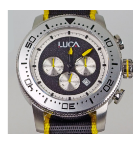
CH-1, Obs-Firefly, NATO