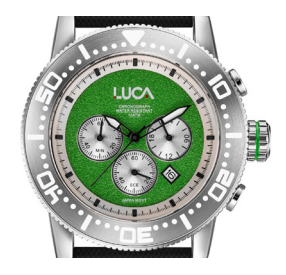
India (Green) Uweekend Business Casual Dress "Outdoor" Off Wrist

Obsidian Firefly (Black/Yellow) Ueekend Business Casual Dress 'Outdoor" Off Wrist